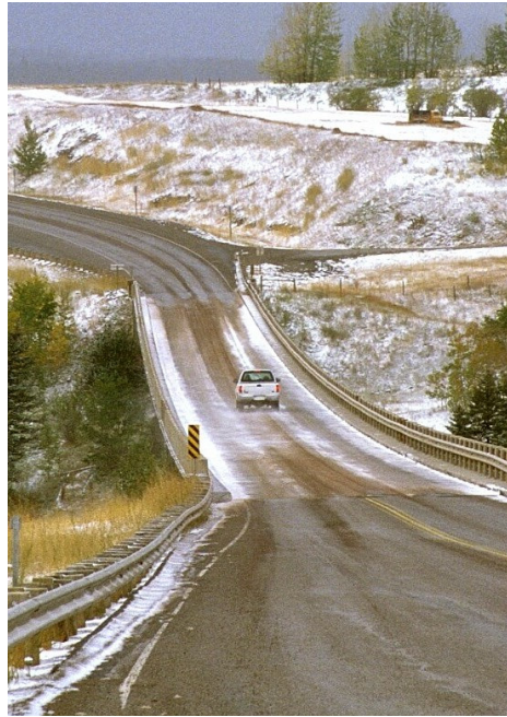
Fig. 4 Ice remains on a bridge deck whilst approach roads are clear

friction which should save both chemicals and associated costs, since the deicer tanks will not need filling up so frequently.