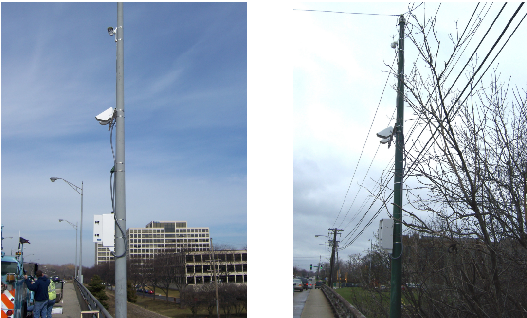
Fig. 5 Non-intrusive sensors mounted on existing street furniture in Chicago

It has already been mentioned that most of the traditional ESS currently deployed in the USA are mounted on dedicated 10m masts, usually constructed on poured concrete bases. Since there is no requirement for the associated atmospheric data for the operation of the non-intrusive sensors, we do not necessarily have to utilize dedicated structures. Also the embedded pucks have to be 'cut' in to the road, which also means that the road has to be closed with the necessary traffic management in place and the associated dangers due to the exposure of the workforce. By comparison, non-intrusive road sensors can be mounted on existing street furniture, see Fig.5, which dramatically cuts down on installation costs. This is extremely pertinent to smaller authorities, such as Public Works departments, many of whom have very tight budgets.