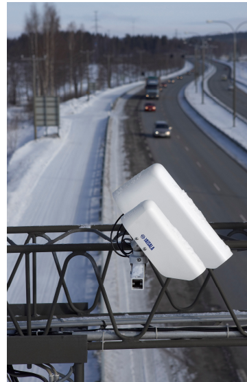
Fig. 2 Non-intrusive sensors mounted on an overhead gantry

The capabilities of the non-intrusive optical sensors have already been tested and a number of papers have been published; one is called Vaisala Remote Road Surface State Sensor DSC111 and the other Vaisala Remote Road Surface Temperature Sensor DST111. These sensors are remote in the sense that they can be installed on any post by the road side or a gantry across the road. Thus installation is fully non-intrusive, i.e. there is no need to install anything on the road surface.